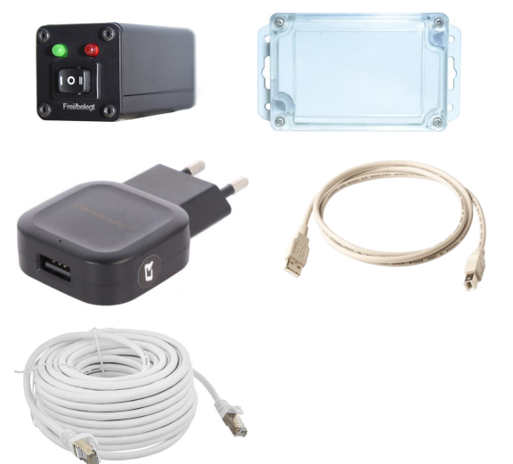
BP2: Compact system for single room, not extendable